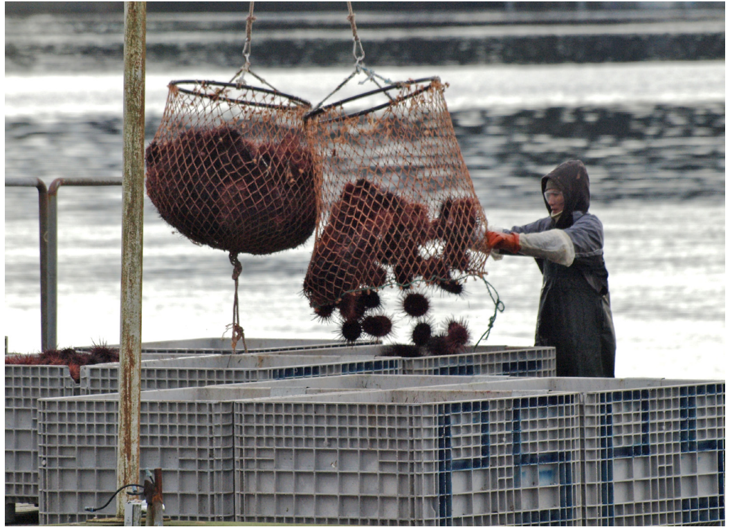
Unloading sea urchins into crates in Kechikan, Alaska.

Before distribution, at least one area 7 of the master carton (or fish box) and retail container must be labeled with the following information: